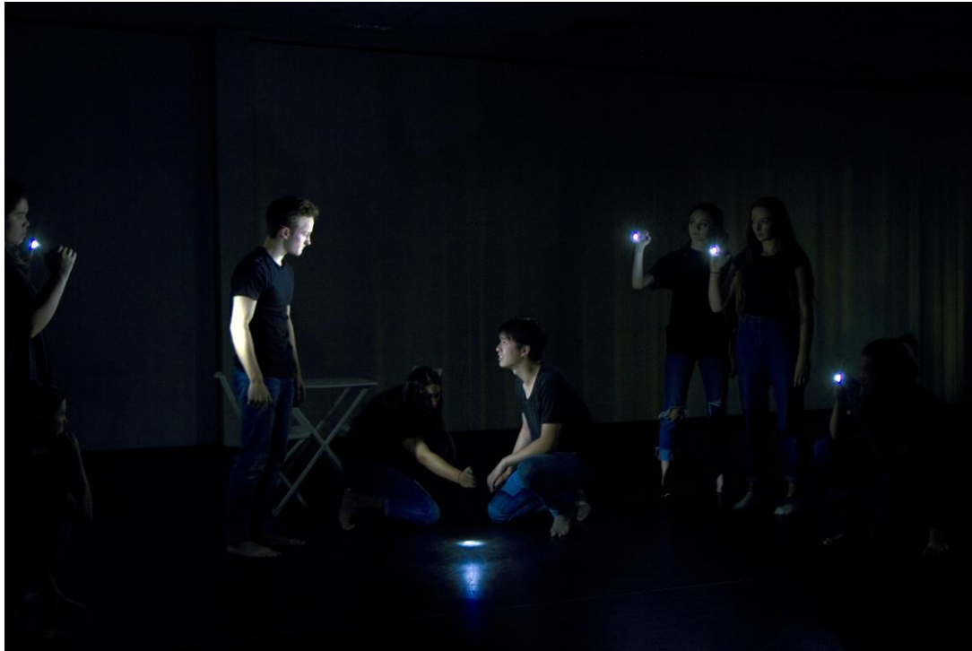
600 Ways to Filter a Sunset by Daniel Evans | Credit: Queensland Theatre